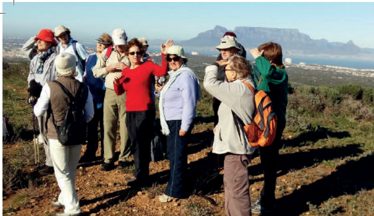
The Two Hills Walk