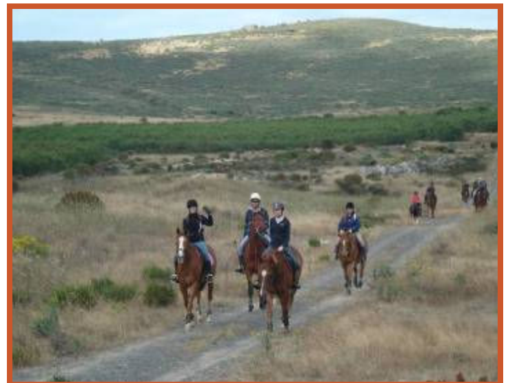
Riders from the Morning Star Equestrian Club

If you would like to participate, contact us on Tel: 021 554 0957 or send us an email on bca@capetown.gov.za .