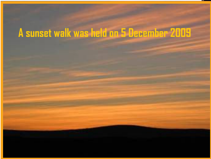
A sunset walk was held on 5 December 2009