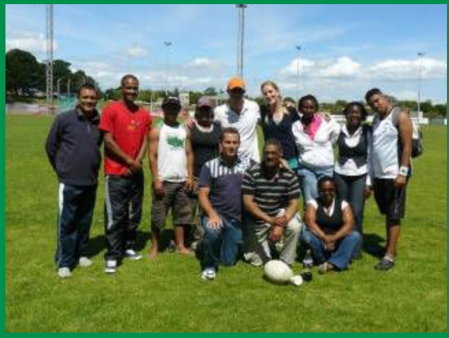
BCA & North District staff members

On 13 November 2009 a sports day was organised for the Nature Conservation Branch at the Parow Sports Grounds. The weather conditions were conducive to undertake quite a number of outdoor sporting codes. This included a Big Walk, Soccer, Tag-of-war, Wheelbarrow Race, Three legged Race, Egg Race, Pillow Fighting and Dominos.