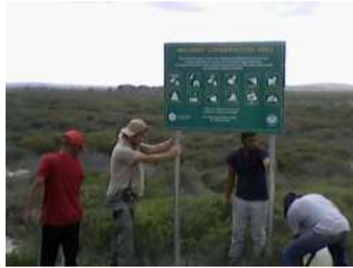
Figure 28 Steyn Signage & Maintenance completed the supply and installation of signage in the Blaauwberg Nature Reserve coastal section.