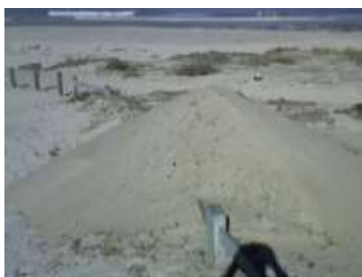
Figure 21 Illegal dumping of sand at Kreeffebaai