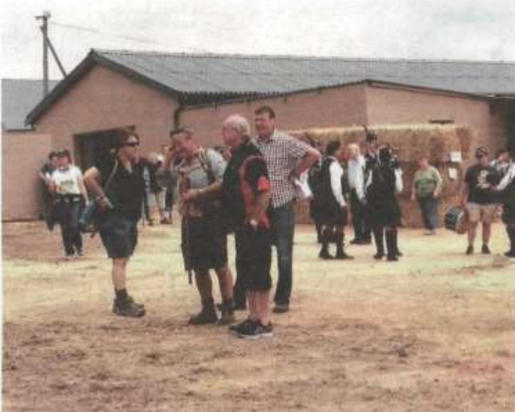
■ The cannon was fired at noon in remembrance of all those who fell in the Battle of Blaauwberg 1806.