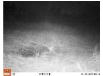
Figure 9 Tyto alba (Barn Owl)