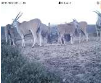
Figure 6 Taurotragus oryx (Eland)