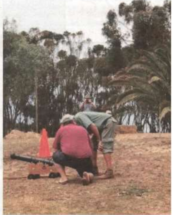
■ The cannon gave several onlookers a fright.