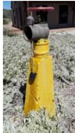
Figure 31 The leaking fire hydrant at Eerste Steen Resort was repaired by contractors