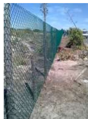
Figure 24 to 27 BBNR staff commenced with the repairs and maintenance of the Melkbos Conservation Area fence at Bato Way.