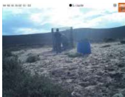
Figure 23 Trespassing on Blaauwberg Nature Reserve