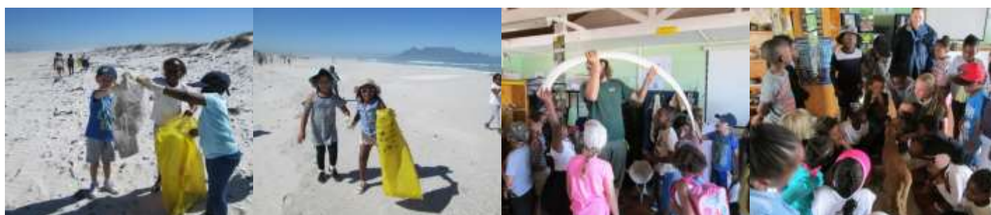
Figure 16 to 19 Blouberg Ridge Primary marine pollution and beach clean-up programme (Photographs: Elzette Krynauw).