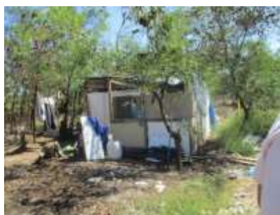
Figure 22 Illegal structures at Melkbos Conservation Area