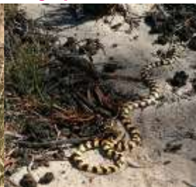
Figure 11 Homoroselaps lacteus (Spotted Harlequin Snake)