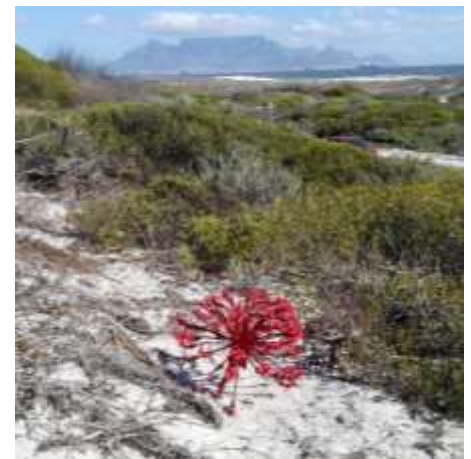
Figure 5 Cape Flats dune strandveld