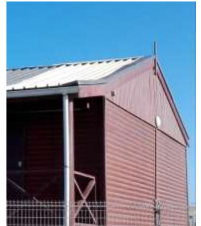
Figure 32 The Environmental Education Centre roof was repaired by contractors

For more details with regards to items mentioned in the above Report Document, please refer to the relevant site calendars on www.biodiversity.co.za . For more information on the City's nature reserves, visit http://www.capetown.gov.za/Explore%20and%20enjoy/Nature-and-outdoors/Our-precious-biodiversity/City-nature-reserves