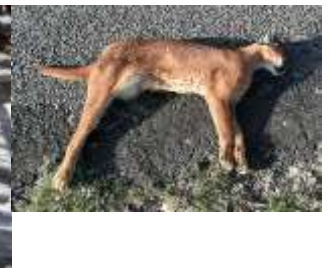
Figure 13 Caracal caracal