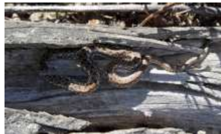
Figure 12 Juvenile Pseudaspis cana (Mole Snake)