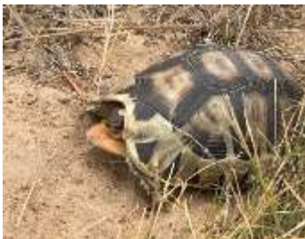
Figure 10 Chersina angulata (Angulate Tortoise)