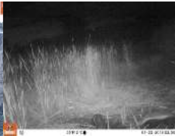
Figure 7 Mellivora capensis (Honey Badger)