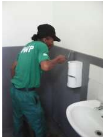
Figure 30 The EPWP Working for the Coast team painted the public ablutions at Eerste Steen Resort