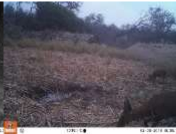
Figure 8 Sylvicapra grimmia (Common Duiker)