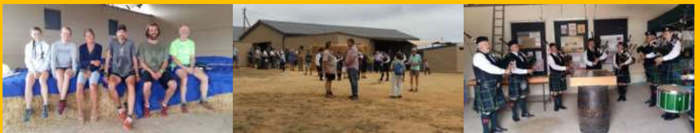
Figure 1 to 3 FoBCA and its partners once again organised an important and exciting commemorative event to commemorate the Battle of Blaauwberg of 1806 (Photographs: FoBCA).